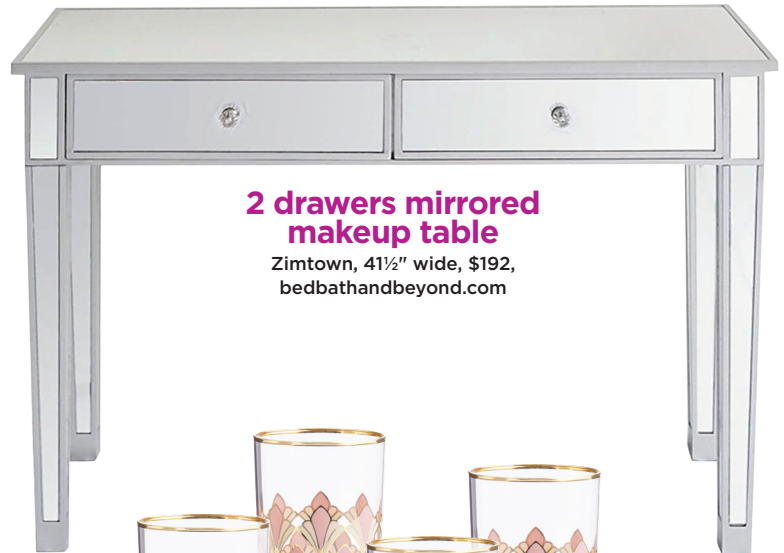
2 drawers mirrored makeup table Zimtown, 41½" wide, $192, bedbathandbeyond.com