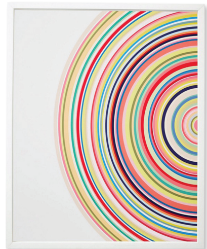
half circle print 24" x 30", $440, dawnmichellewolfe.com