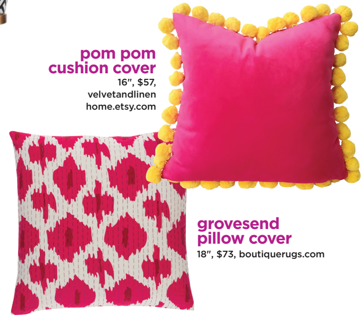
pom pom cushion cover 16", $57, velvetandlinen home.etsy.com