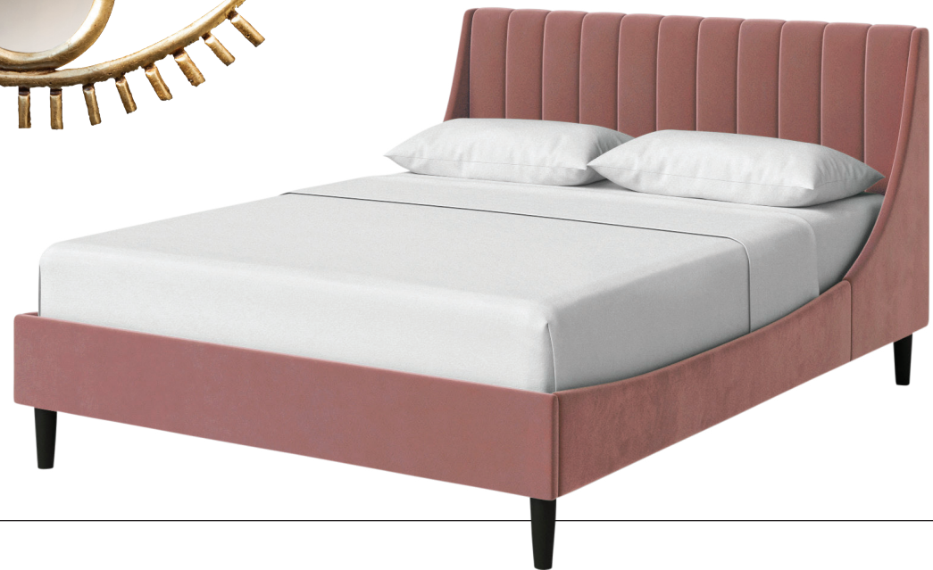
helaina wingback bed $790, jossandmain.com