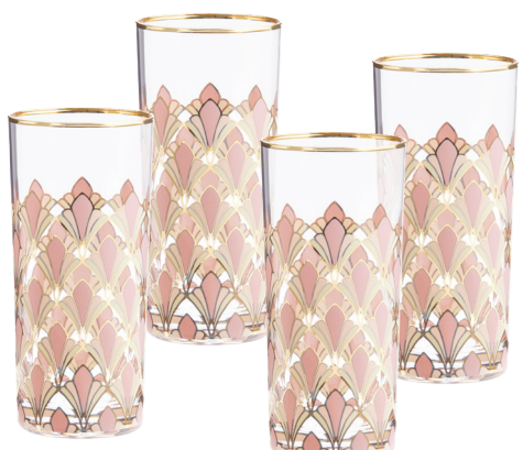
gable art deco highball glasses $8 each, worldmarket.com