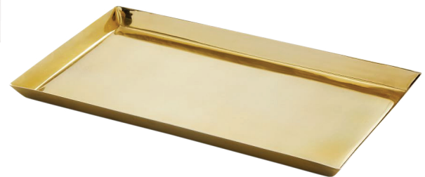
foundations tray 12", $46, westelm.com