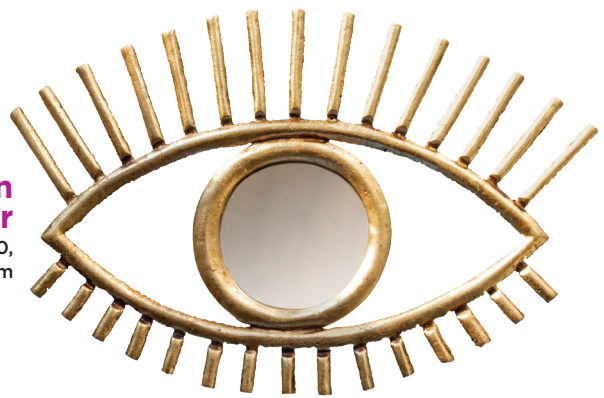
peruvian wall mirror 8", $40, lunasundara.com