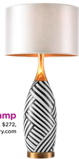
elegant lamp 27¾" tall, $272, stauntonandhenry.com