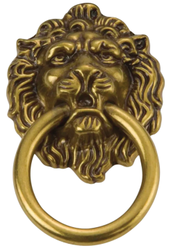
manor house pendant cabinet knob Hickory Hardware, $39 for 10, build.com