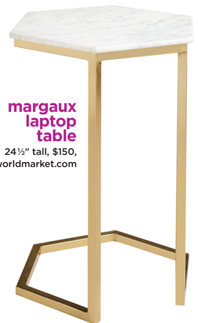
margaux laptop table 24½" tall, $150, worldmarket.com