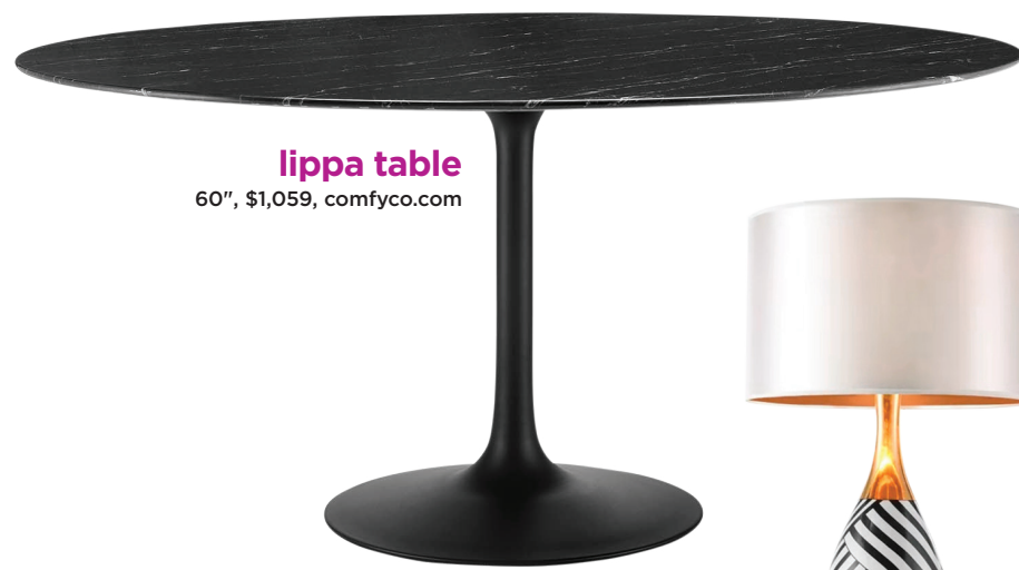
lippa table 60", $1,059, comfyco.com