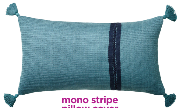
mono stripe pillow cover 12" x 21", $39, westelm.com